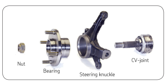
Bearing HBU 2.1 and surrounding components.